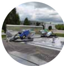
Split Fuel Tank