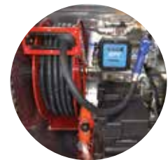
20' Fuel Hose