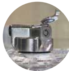
Lockable Security Cap