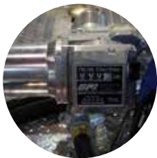
Fuel Meter with Filter